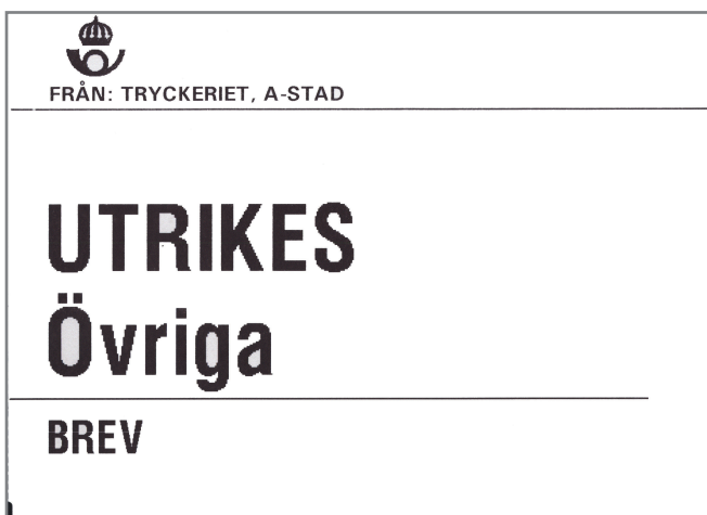
Example of freight car label for Letter Shipments International First Class Mail.

Any remaining items (which do not need their own load carrier) should be loaded in load carriers, addressed to "Utrikes Övriga".