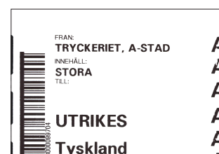
Example of crate label for Letter Shipments International First Class Mail.